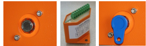
Fitted Touch Switch Rear View Touch Key