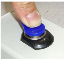
Touch Socket TSL & TSM