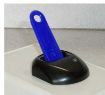
Touch & Hold Socket Oval and Square

The manufacturer reserves the right to change specifications without prior notice