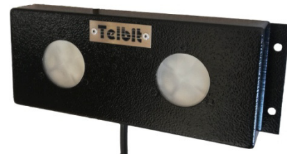
Lamps in Off-state