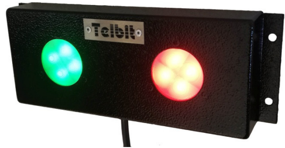
Lamp with Green & Red LED